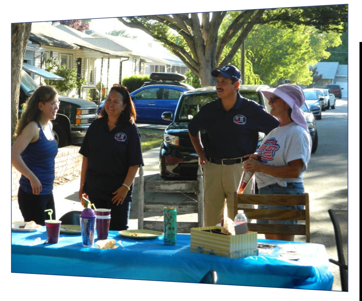
Connecting to Our Communities